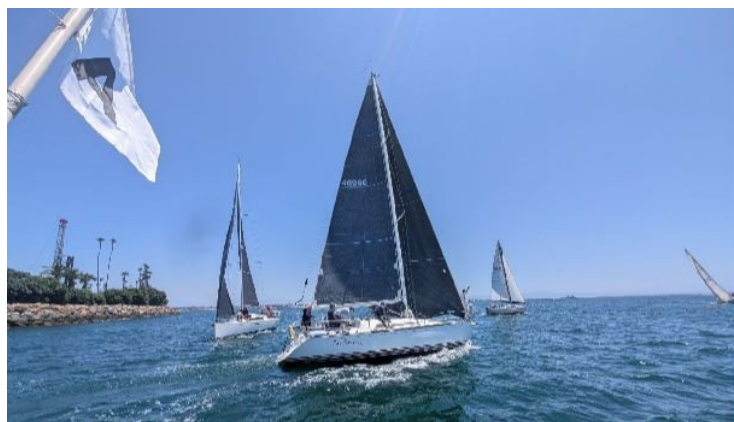
Racers setting up at the start line in the Reach for the Beach race.

Join Little Ships Fleet Yacht Club for the