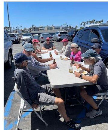
LSFYC Reach to the Beach racers at the shed after race burger bash.