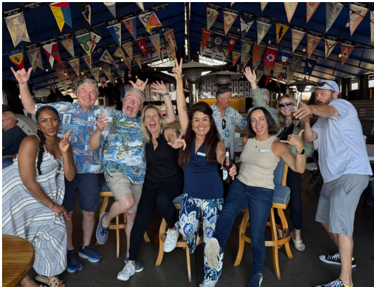
Cerritos Bahia YC