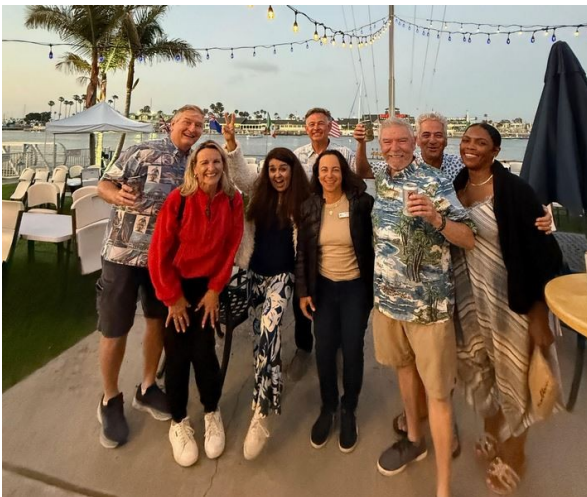
Alamitos Bay YC