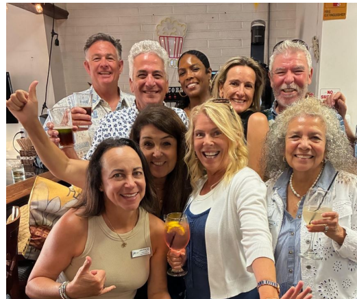
Seal Beach YC