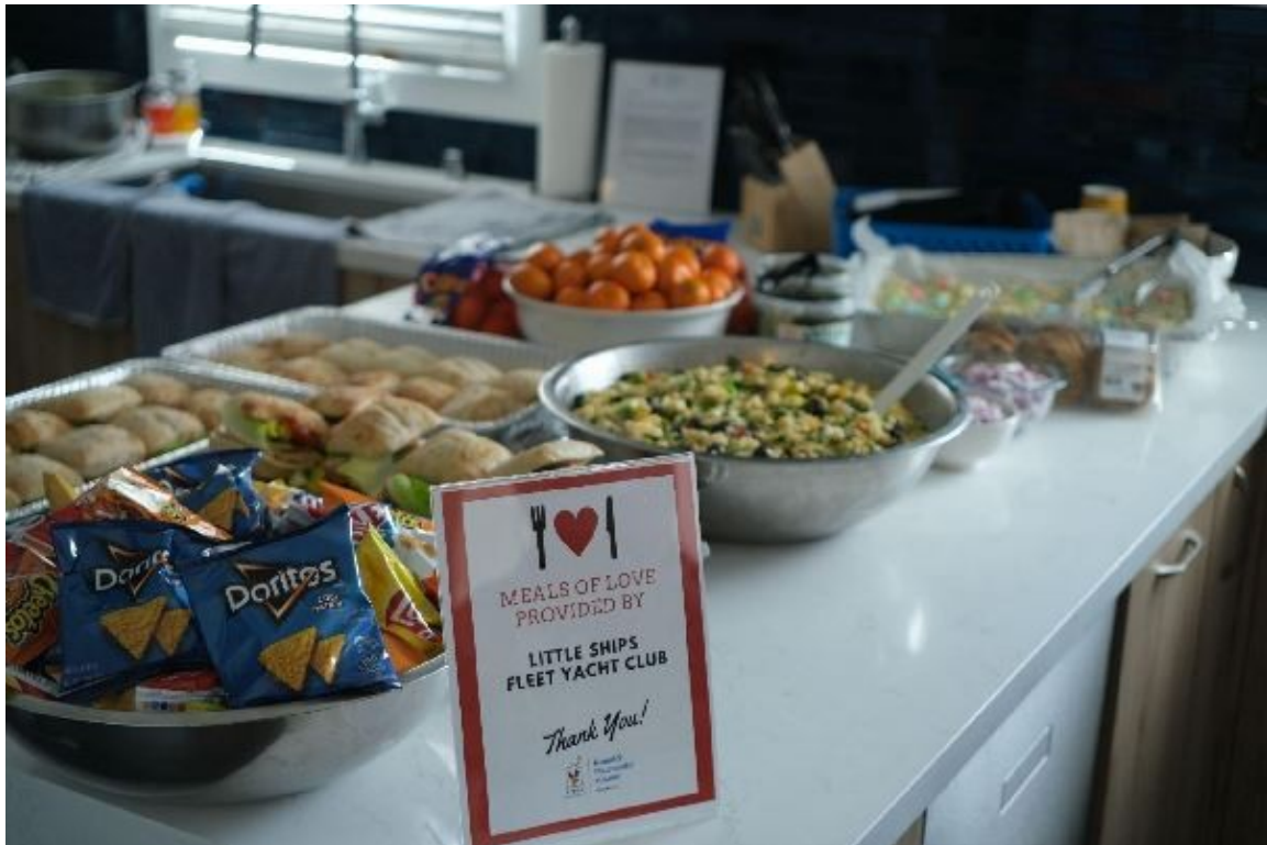
Meals provided by LSFYC to the Ronald Mc Donald House in Long Beach for families of children treated in the hospital.