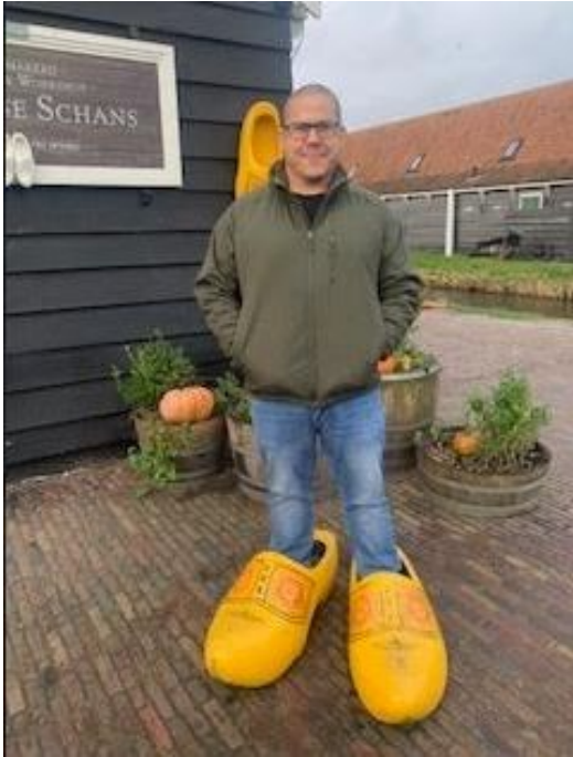
Filling out the big shoes in Holland.