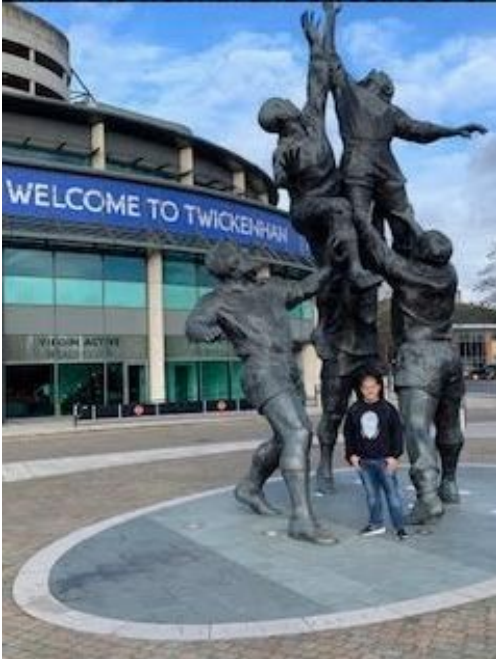
Rugby, fishnchips, bangers and mash in England.