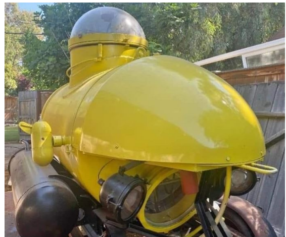
Yellow sub listed.