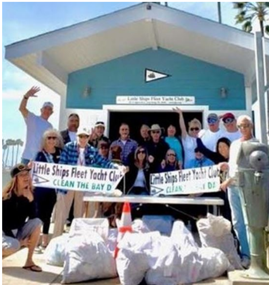
LSFYC members show off the haul of trash from a previous Clean the Bay Day..