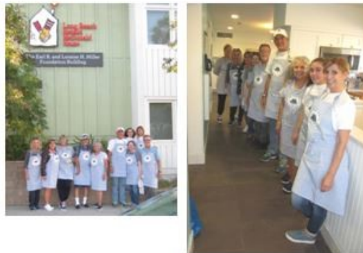
Little Shippers at the Ronald McDonald House after preparing a meal in Oct 2019

*Ronald McDonald House 500 E. 17 th St, Long Beach, CA 90806