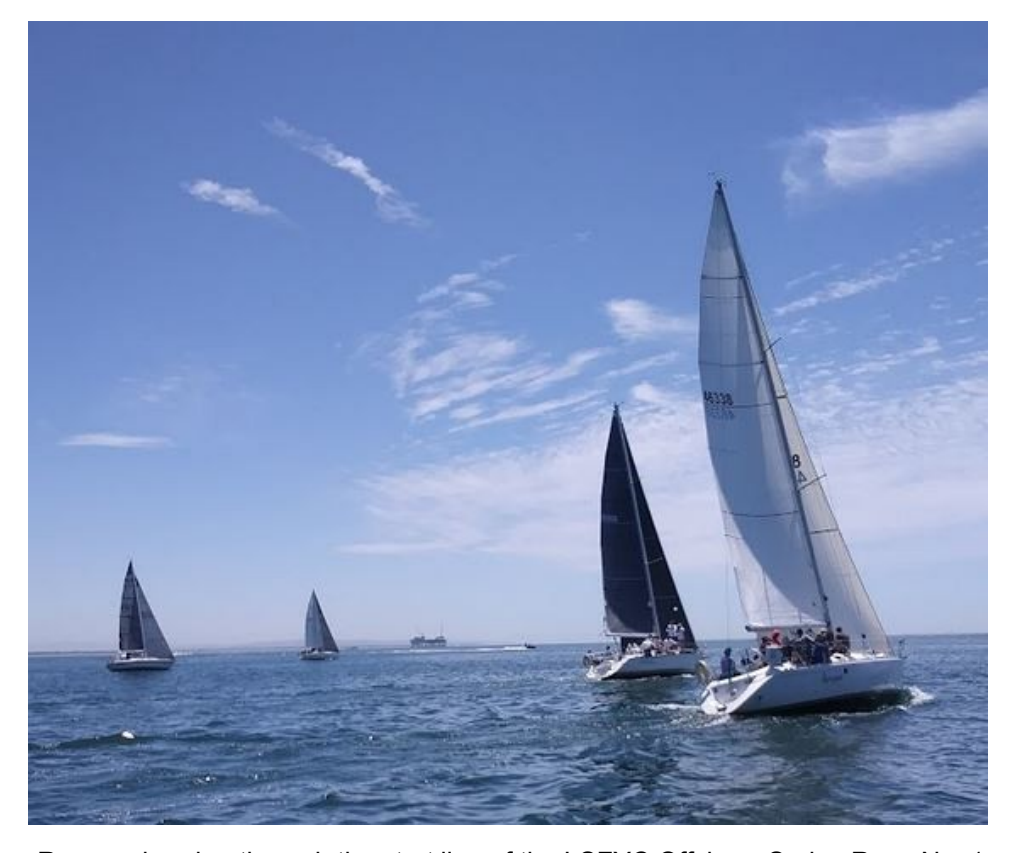
Racers charging through the start line of the LSFYC Offshore Series Race No. 1