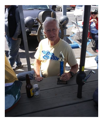
After race trophy presentation & food fest with racers discussing the course and the winners: A class and non spin