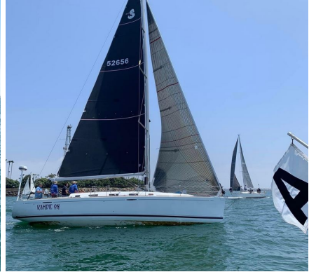
Reach to Beach Committee boat crew and entries