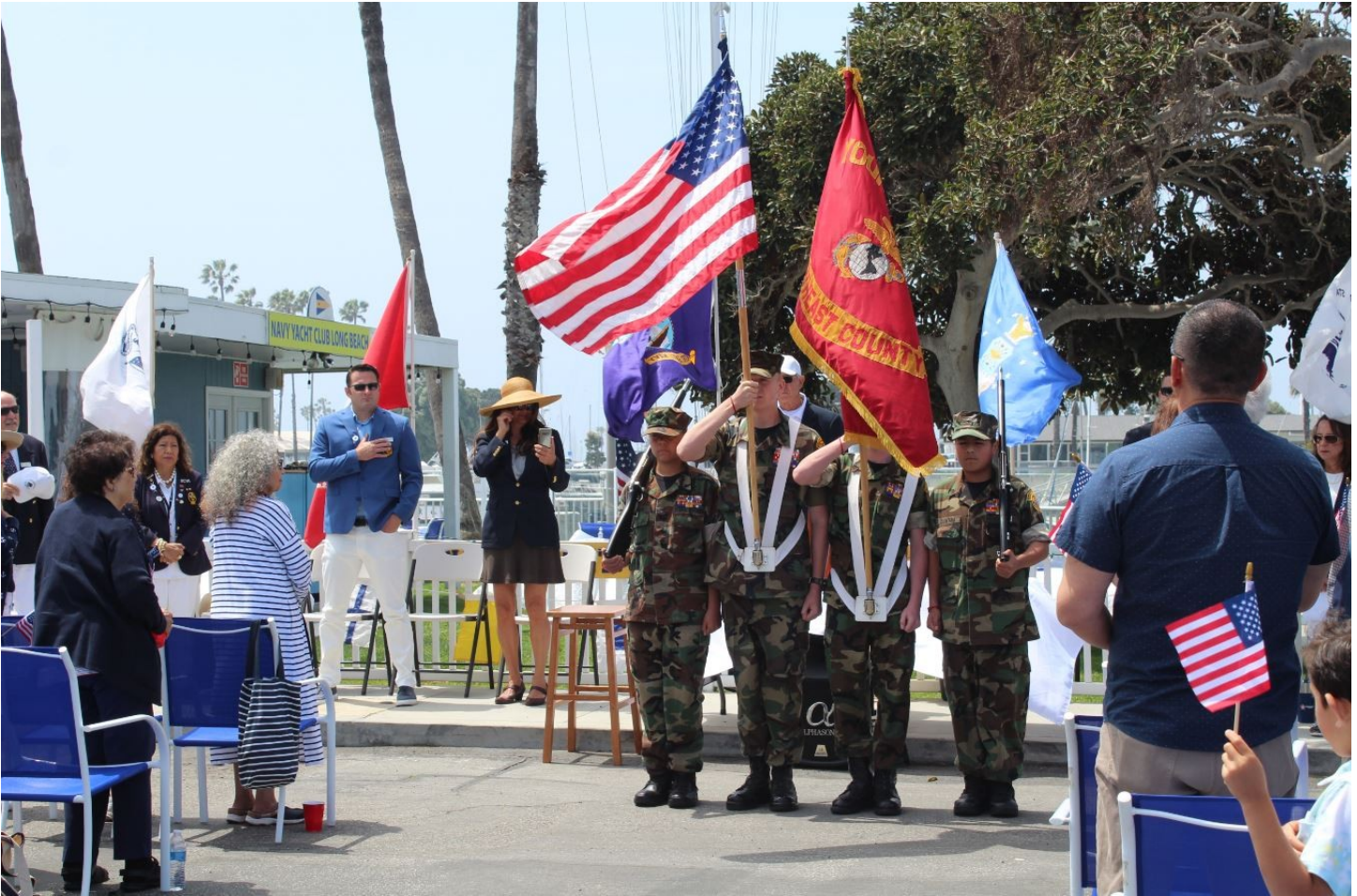
Presenting Old Glory on LSFYC Opening Day Ceremony