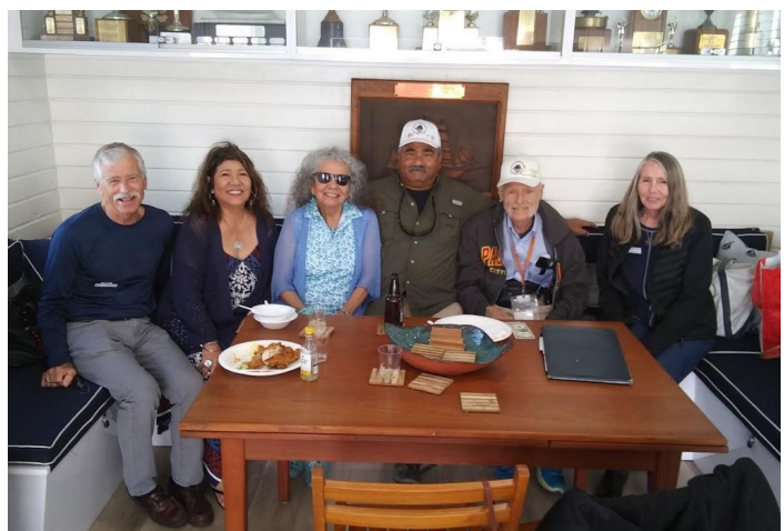
Members inside the Shed