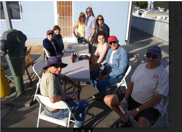
Members outside the Shed