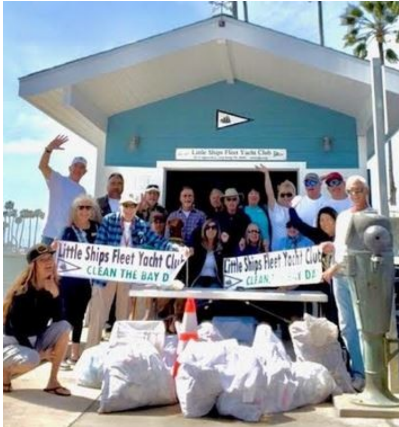
CLEAN THE BAY DAY WITH THE LITTLE SHIPPERS