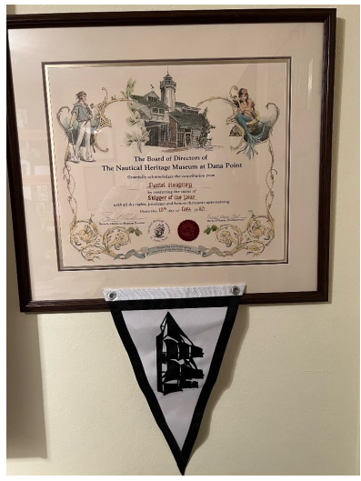
Skipper of the Year Award

Glorius sunset at Bonelli Bluffs RV resort