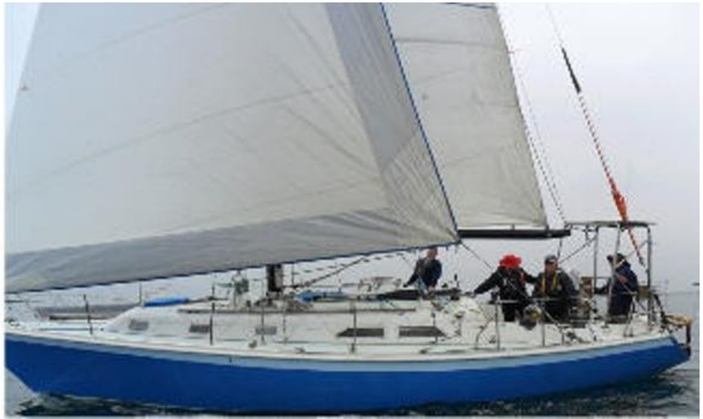
Darrell Sausser on his big blue Escapade