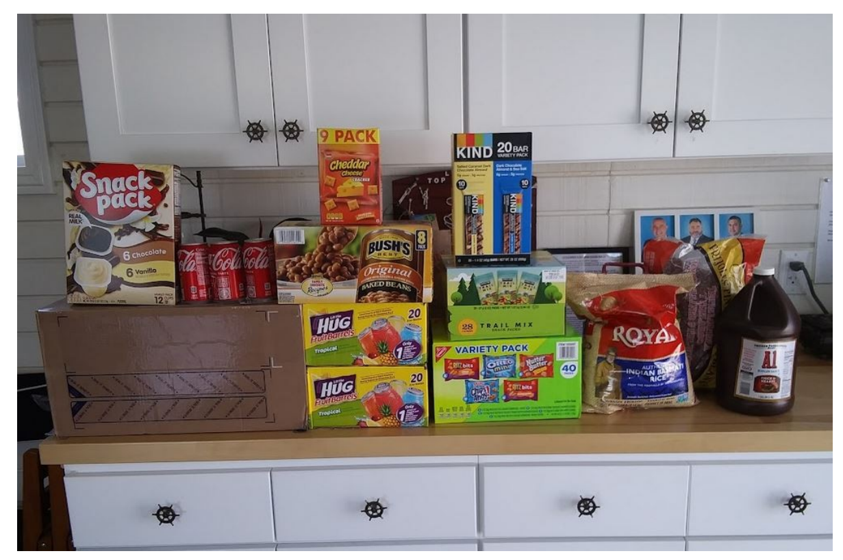
Some of the food items donated for the Ronald Mc Donald House to be delivered Oct 8. Many thanks and much appreciation to many of the LSFYC members for the food and monetary donations.