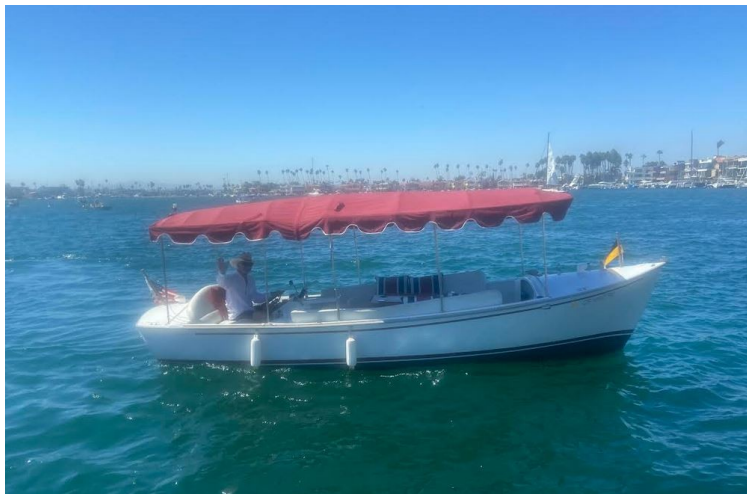
Jeff Potter arriving to the Shed Happy Hours by land and by sea