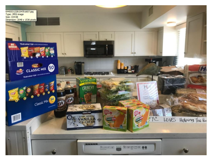
All of the meal/pantry food items LSFYC donated & delivered to the Ronald McDonald House Long Beach