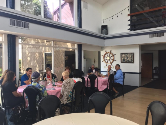
LITTLE SHIPPERS ENJOY BRUNCH WHILE AT LSFYC LAND CRUISE TO HUNTINGTON HAR- BOUR YC.