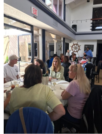
PHOTOS BELOW OF THE AFTER RACE TROPHY PRESENTATION AND LSFYC PICNIC AT NYCLB FACILITY