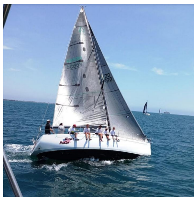
Rode Rage under sail