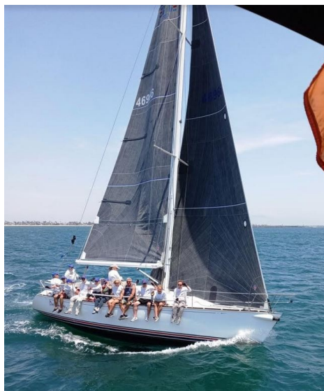
Dos Amigos Dos with full crew!