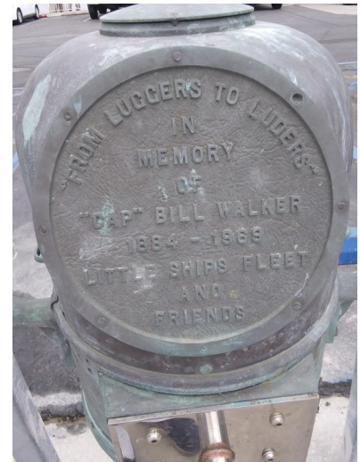
Bronze plaque dedicated to "Cap" Walker. Awaiting for a good cleanup and polish.

See you all on LSFYC Opening Day June 19.