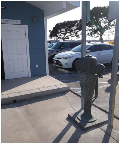
Binnacle in new location in front of the shed

For many years the old ships binnacle has been a fixture on the NYCLB grounds (the old LSFYC clubhouse years ago). Prior to that time, it has been placed and relocated from one place to another. NYCLB is undergoing renovation and grounds improvement that required that, once again, the binnacle be moved. What better spot than at the LSFYC shed. The attached plaque as inscribed is dedicated to Comm William "Cap" Walker , one of the early and supporting members of LSFYC. There is also a ship's wheel (in custody of S/C Roy Queen ) to be attached to the binnacle on special occasions.