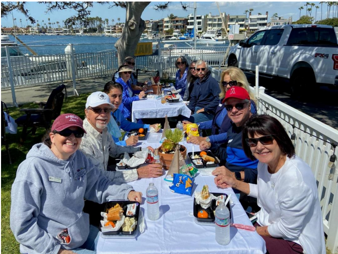
Little Shippers enjoying a great meal