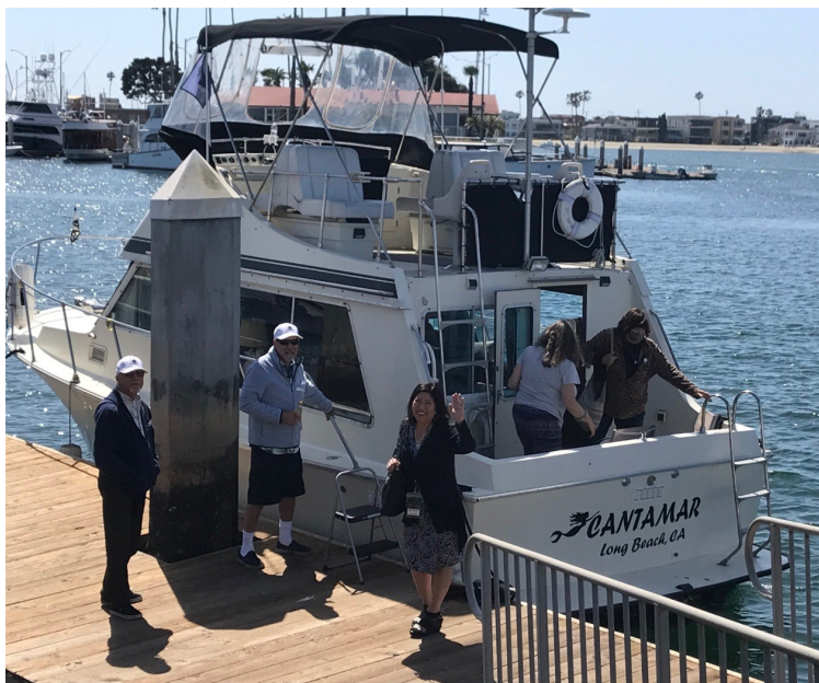
After the picnic cruise on the bay..