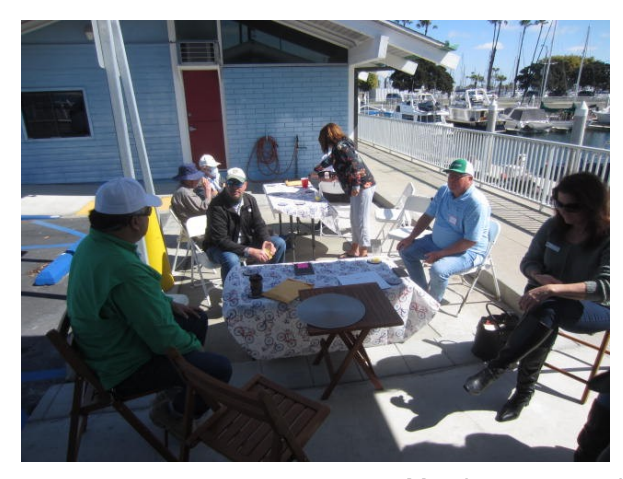
Members conversing outside the shed.