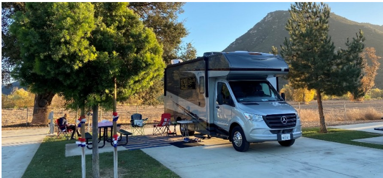
The Motihome at the RV park