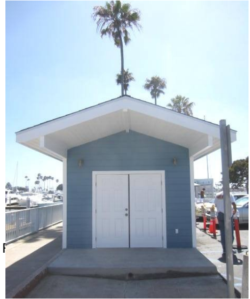
View from Fire Station