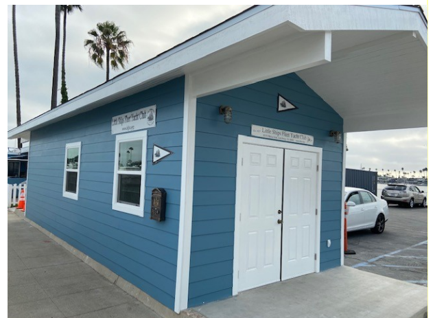
View from along marina walkway