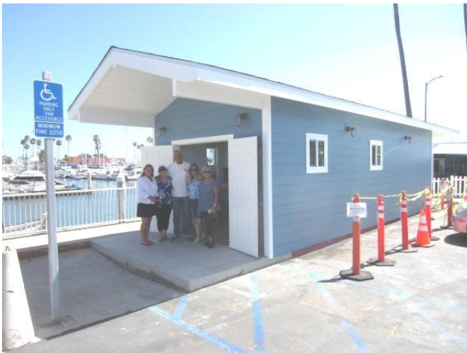
The finished shed!