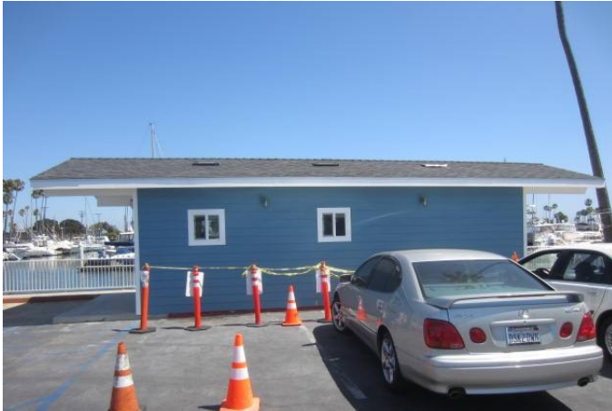
View from parking area