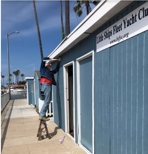
Moti the demolisher at work