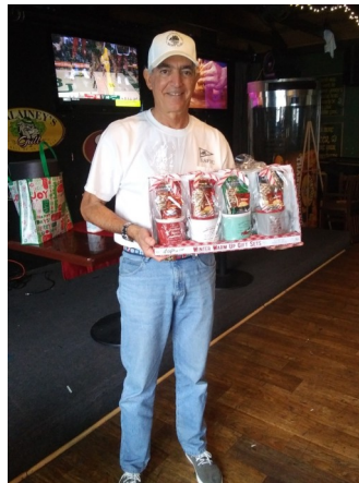
Moti gets a nice assortment of goodies