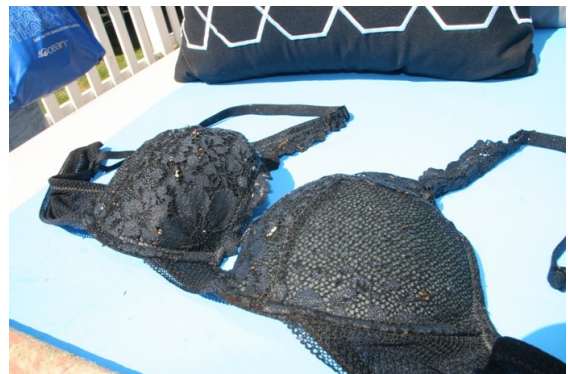
The winner for most unusual item found!