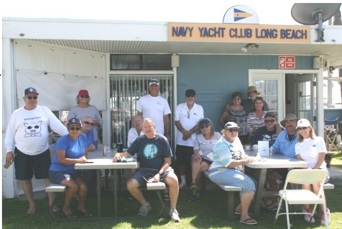
Little Shippers at the end of the day.