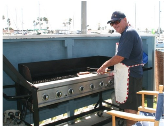
NYCLB's Hap at the BBQ