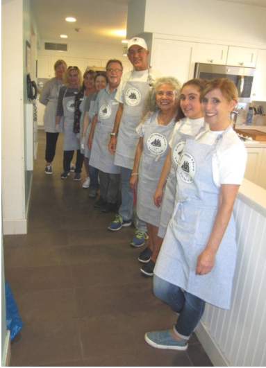
The LSFYC gang of cooks.