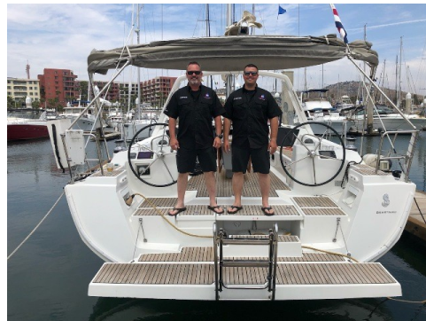
Two happy guys