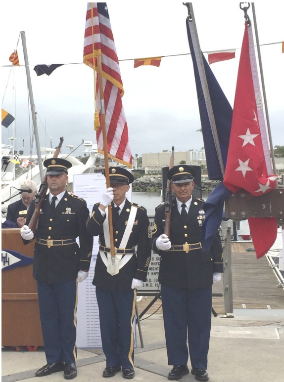
Presentation of the Colors

I only hope that my small contributions can be somehow useful for enhancing our current member's experiences and together our efforts will make a positive impact on the legacy of this historic and resilient yacht club.