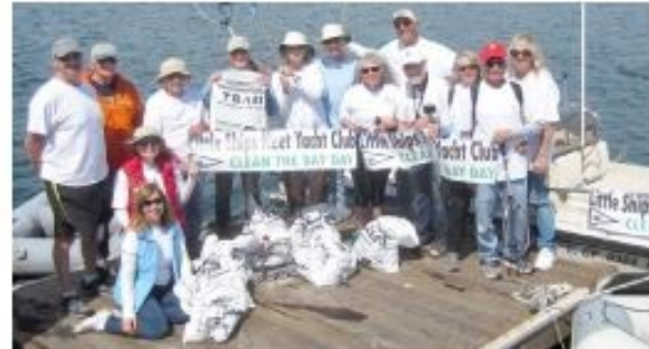
LSFYC members with some of their trash haul from the Bay.