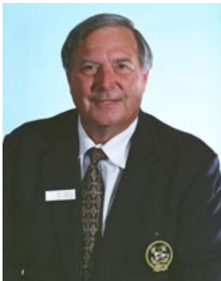
Feb 5, 1947—April 24, 2019

In later years, he was part of the Seal Beach Police Dept as Chief Radio Operator.