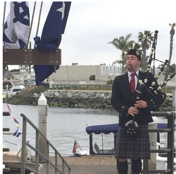
Bagpiper at HHYC Opening Day