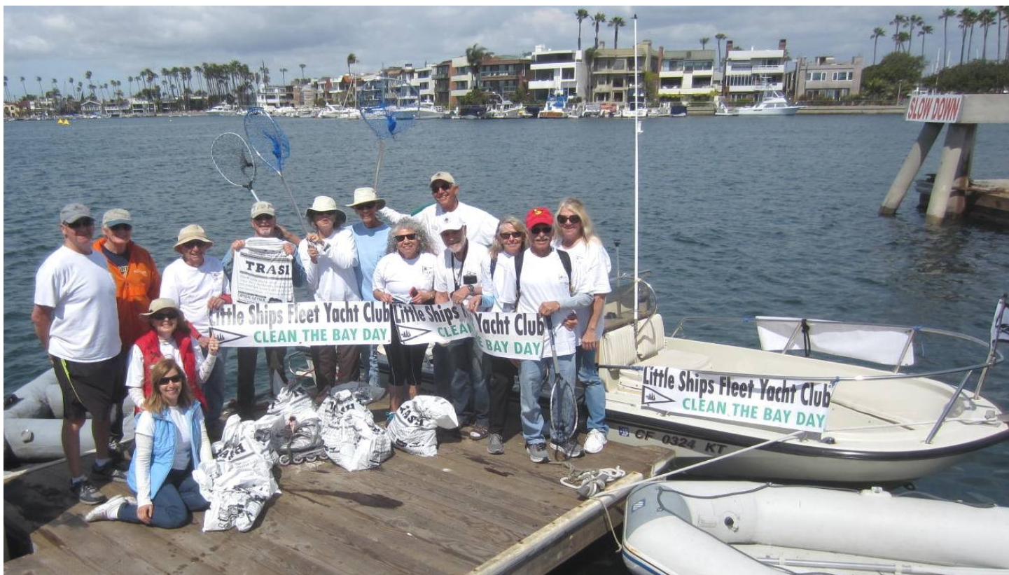
LSFYC MEMBERS DISPLAY 150LBS OF TRASH COLLECTED ON CLEAN THE BAY DAY