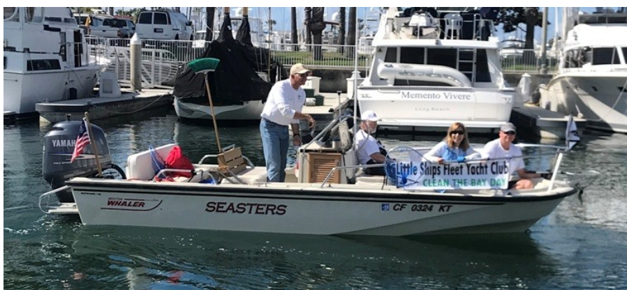
The crew of the "Motiboat" at work...