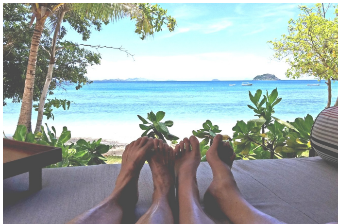
Fiji feet...life is good!