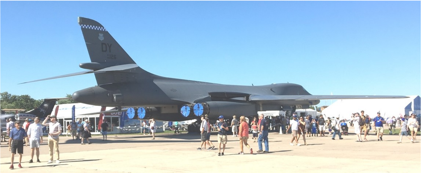
B-1B Lancer display