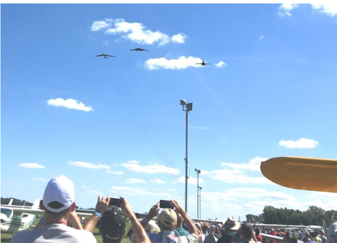
Overflight of B-52, B-2 & B-1B