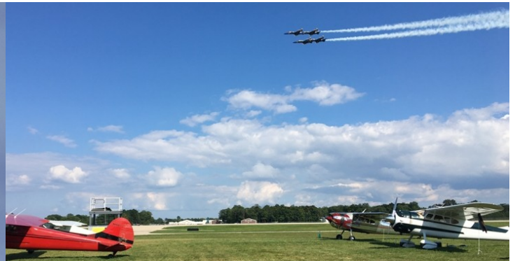
Blue Angels overflight