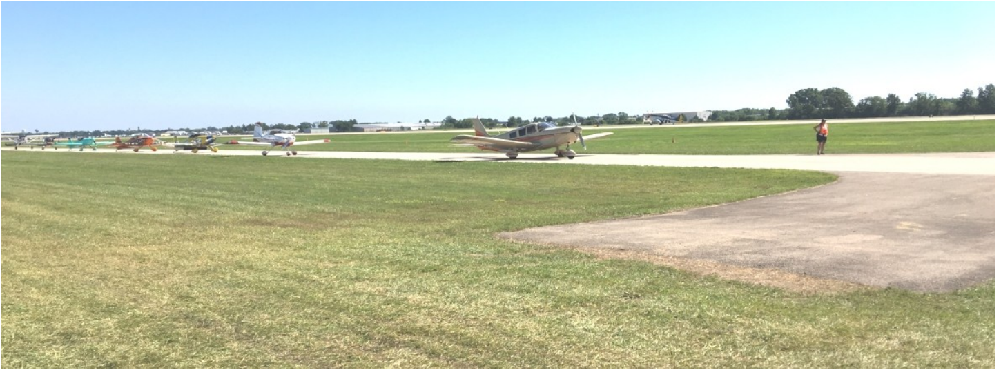
Aircraft departing the field