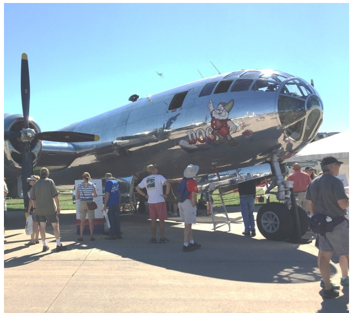
Newly restored B-29