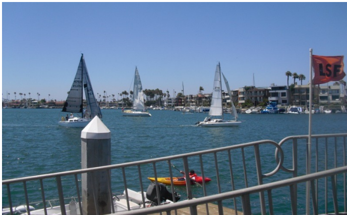
At the finish line