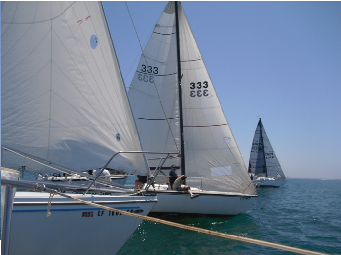
B fleet start