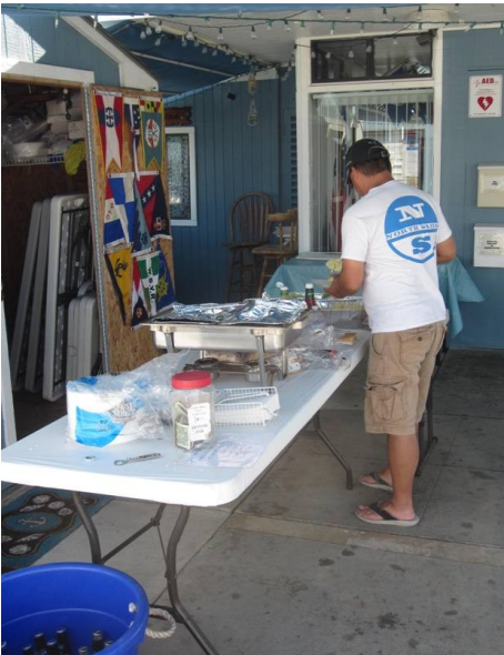
Burgers, beer and hot dogs for the racers!