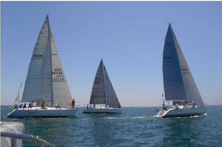
A fleet start