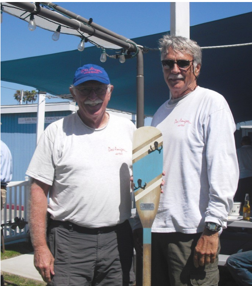
Dos Amigo Dos skipper & crew 1st place