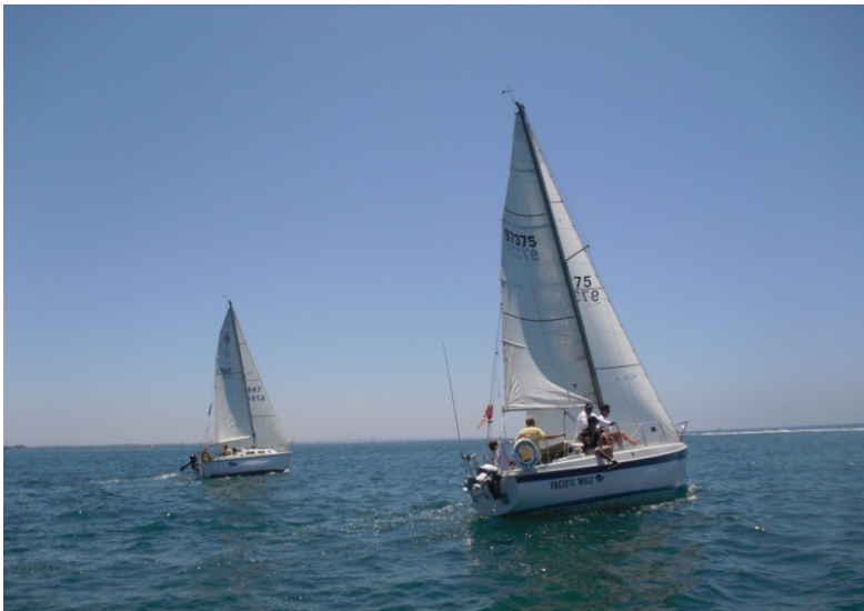
Non spin start