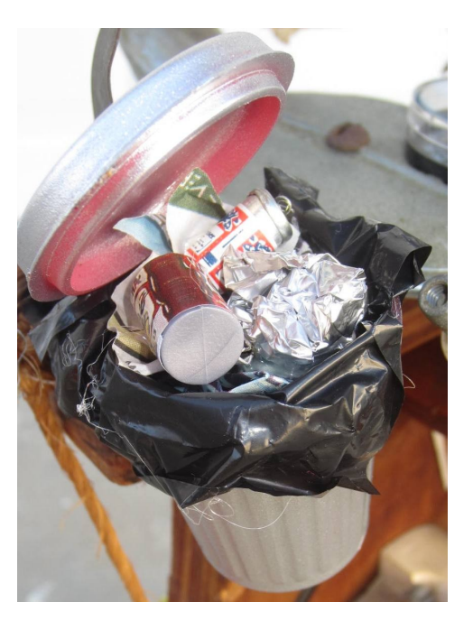
The trash can

So in honor of you saving it, it's going to you. We've even added a little trash can as a reminder too!