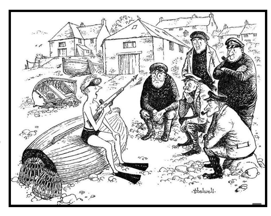
Little Ships ,Old Salts and Tall Tales Sunday February 23, 3-5 pm at Cerritos Bahia YC (6291 PCH, Long Beach 90803)