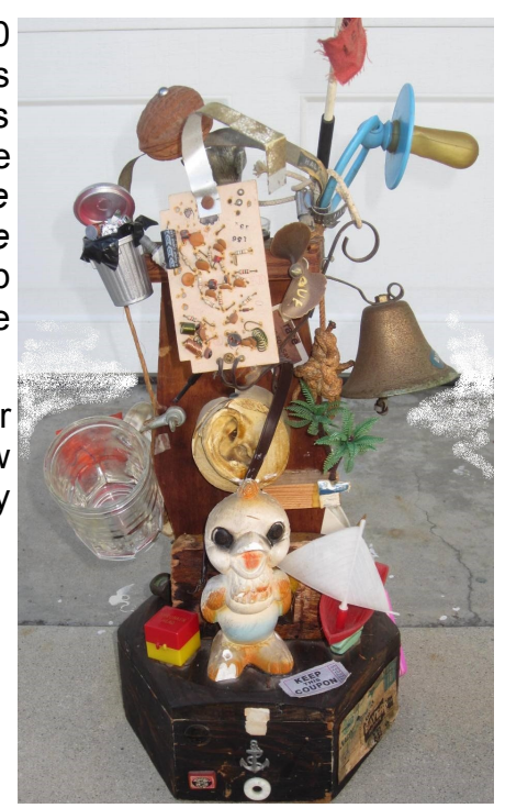
The GOOF Trophy